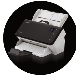
Kodak E1025 and E1035 Scanners

* Throughput speed may vary depending on your choice of application software, operating system, PC and selected image processing features.